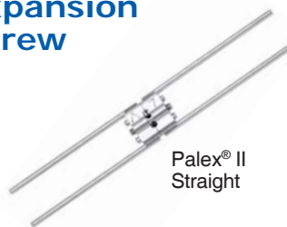
Palex® II Straight