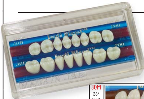
Combo's are packaged in an attractive kit box